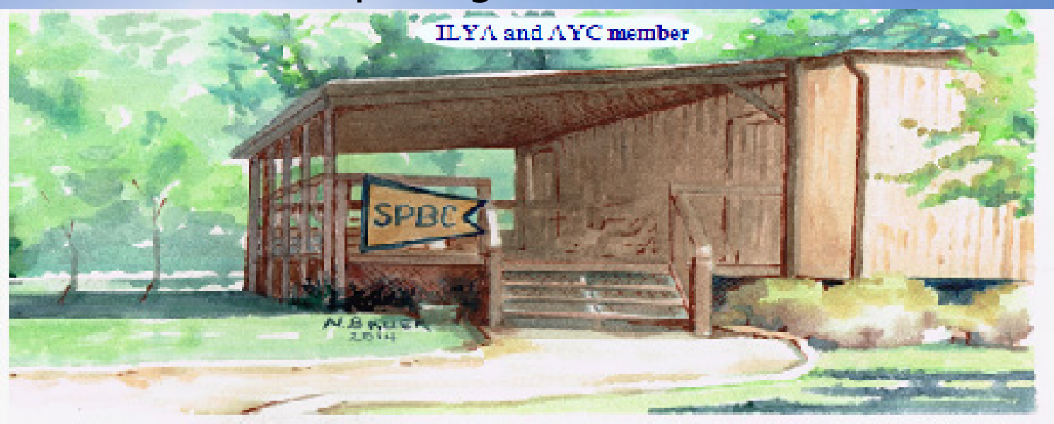
Please visit our website at www.sunparlourboatclub.com