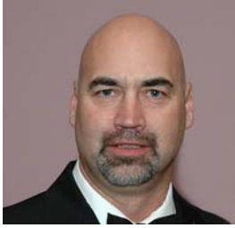
Rear - Commodore's Report March Log