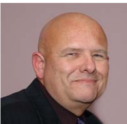
Communication Report March Log

It would be great if everyone could renew their memberships and check for errors in the 05 roster before the new one for 2006 goes to print. If you have any interesting stories that you want to share with the members, please send them in along with any photos.