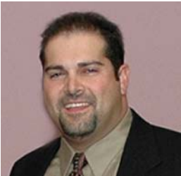
Fleet Captain's Report March Log

Well, another month has past and another fun event has gone by. This years AYC Ball was a huge success and everyone had fun. (even if some of us can't remember all of it) A big "thanks" goes out to the AYC room committee and all that helped out to make this weekend a success and fun for all. Anyone who has pictures of the AYC weekend and would like to share them, please post them on the SPBC website so we all can enjoy.